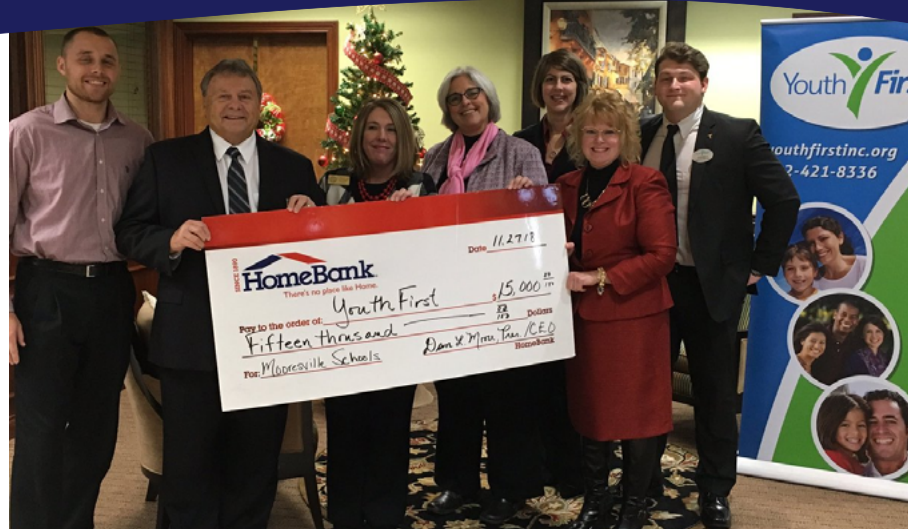
Funding for the program was provided by Home Bank and the Kendrick Foundation.

program helps with communication skills, reducing stress, and focusing on positive family time. Participating families will get a free meal and incentives at each session as well as leaving with tools for boosting family resiliency.