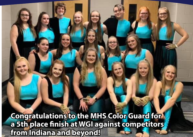
Congratulations to the MHS Color Guard for a 5th place finish at WGI against competitors from Indiana and beyond!