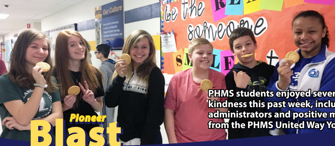
PHMS students enjoyed several random acts of kindness this past week, including cookies from administrators and positive messages on lockers from the PHMS United Way Youth Council